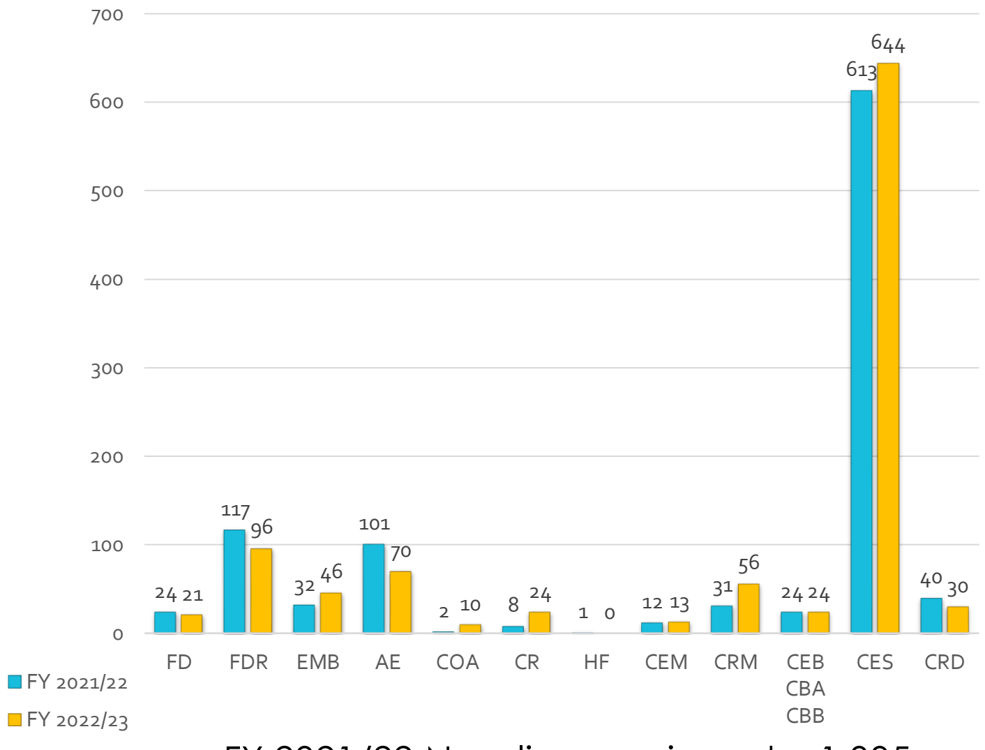
FY 2021/22 New licenses issued = 1,005 FY 2022/23 New licenses issued = 1,034